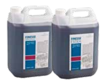
Finesse Original (5I, 10I, 25I) Finesse Extra (5I, 10I, 25I)