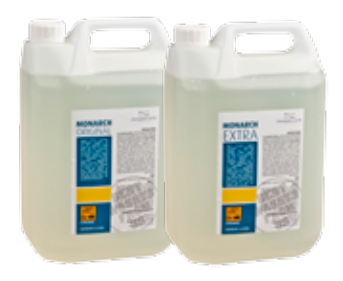
Monarch Original (5I, 10I, 25I) Monarch Extra (5I, 10I, 25I)