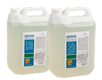
Crystal Original (5I, 10I, 25I) Crystal Extra (5I, 10I, 25I)